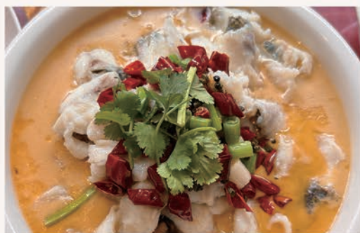
Boiled Seabass with pickled cabbage and chilli (spicy)