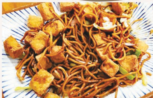
Crispy fried tofu with noodles (2,6)