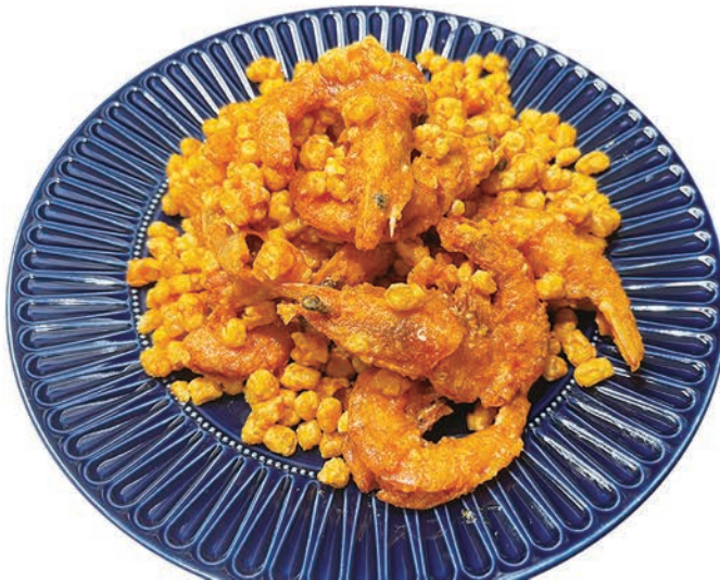
King Prawn with Egg Yolk(2,3,6,11) € 16.90