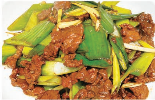
Stir-Fried Beef with scallions (6) € 14.90