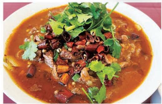
Poached Sliced Beef / Pork in Hot Chilli Oil(6,8)