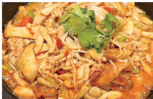
Mixed Mushroom with pork Belly(6) € 14.90