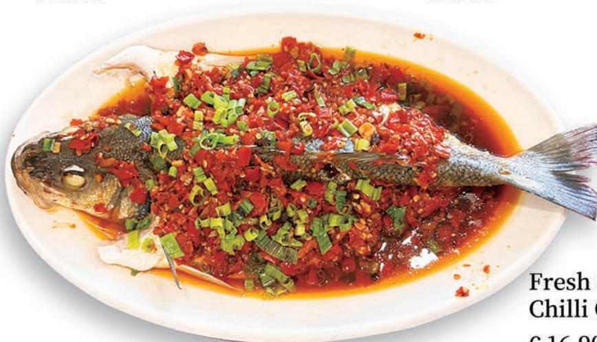
Fresh Sea Bass in Hot Chilli Oil (6,8)