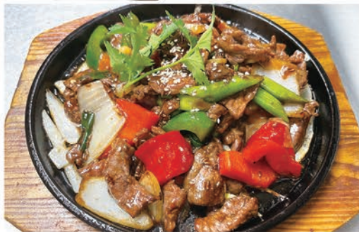
Sizzling Tender Beef in Black Pepper Sauce(6) € 14.90