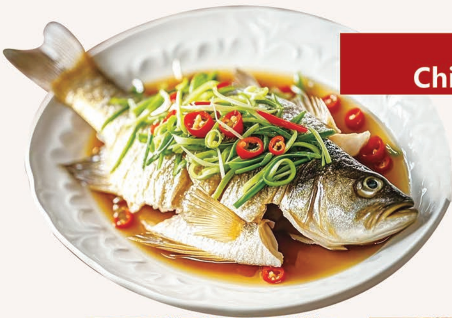
Steam Seabass with soy sauce