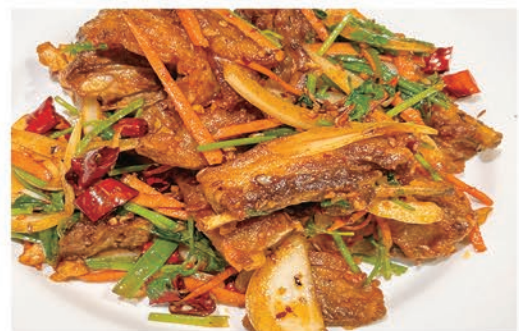
Lamb Ribs with Cumin (10)