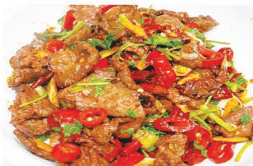
Xiang Style Beef