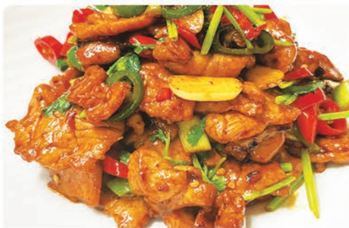
Xiang Style Lamb