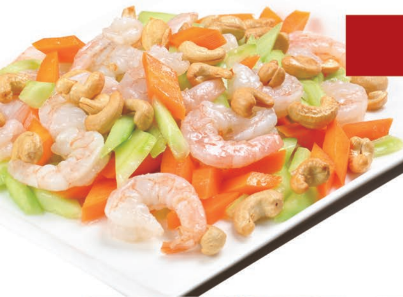
King Prawn with Cashew Nuts and celery(4,6,11) € 16.90