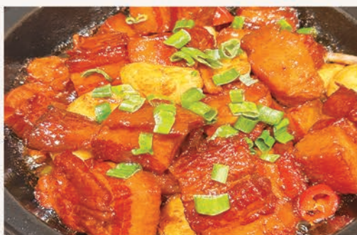
Braised Pork belly in soy sauce (6)