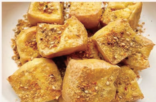
Crispy tofu with salt and chilli