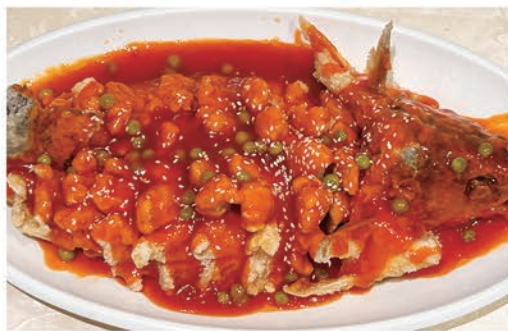
Deep Fried Seabass Without Bone In Sweet & Sour Sauce (2.6.10) € 16.90