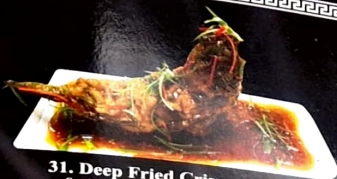
31. Deep Fried Crispy Sea Bass Sea bass in batter, deep fried with garlic and special sweet sauce and spicy sauce 鱼香脆皮鱼 £22.80