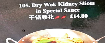
105. Dry Wok Kidney Slices in Special Sauce 干锅腰花 £14.80