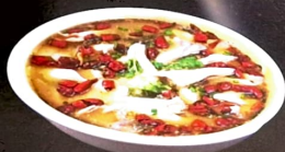
33. Fish Slices in Pickled Vegetables Soup Marinate fish slices boiled with vermicelli noodles and chilli 酸菜鱼 £22.80