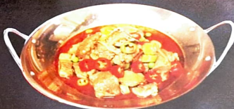
106. Dry Wok Beef Brisket with Peas and Chilli 干锅牛腩 £14.80