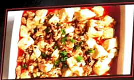
71. Traditional Ma Po Tofu Stir fried with leek, pork mince or without in Sichuan spicy sauce 麻婆豆腐 £10.80