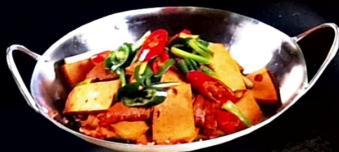
69. Griddle Cooked Tofu Braised Tofu with Chinese leek, garlic and ginger in spicy sauce 干锅豆腐 £11.80