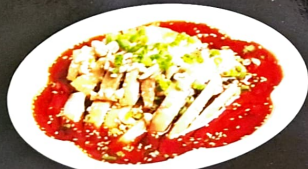
3. Boneless Chicken in Chilli Oil Served on celery bits with lip-tingling spicy sauce. 口水鸡 £8.80