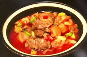
61. Braised Beef Brisket with Peas, Tomato & Chilli Oil 西红柿牛腩 £14.80