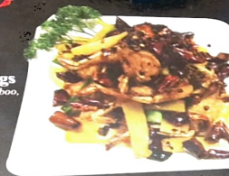
42. Hot & Spicy Frog Legs Frog legs in batter, fried with celery, bamboo, Sichuan peppers and chilli 香辣牛蛙 £16.80