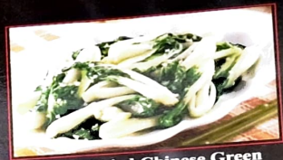
77. Stir Fried Chinese Green Vegetable in Garlic Sauce 蒜蓉时蔬 £9.80