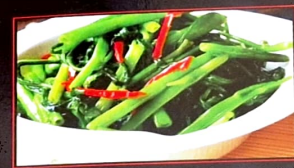
80. Stir Fried Water Spinach with Fermented Beancurd Sauce 腐乳空心菜 £9.80