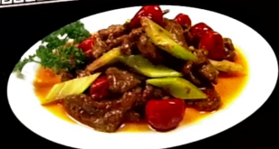
55. Beef in Special Sauce

Stir fried with pickled chilli, celery and garlic in chilli sauce 泡椒牛柳 £14.80