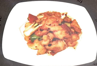
35. Twice Cooked Fish Slices Sliced fish in batter, quick fried with green pepper, leek and Sichuan black beans 回锅鱼 £20.80

All prices are inclusive of VAT, service charge will be added to your bill