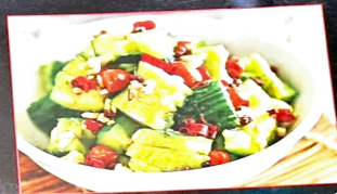
9. Smacked Cucumber Salad with garlic, peanuts, sesame sauce and chilli oil. 爽口黄瓜 £7.90