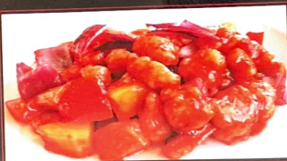
67. Sweet & Sour Chicken with Pineapple 甜酸鸡 £12.80

Quick fried with dry chilli, Sichuan chilli peppers and sesame seeds 辣子鸡 £14.80