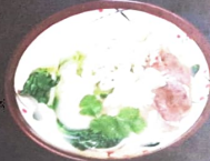
101. House Special Beef Offal Noodle with Coriander in Soup 牛杂汤面 £10.80

All prices are inclusive of VAT, service charge will be added to your bill