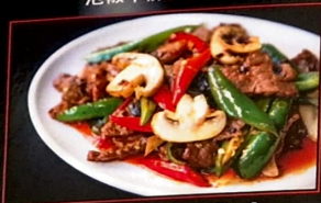
57. Sichuan Style Beef

Stir fried with pickled chilli, celery and garlic in chilli sauce 泡椒牛柳 £14.80