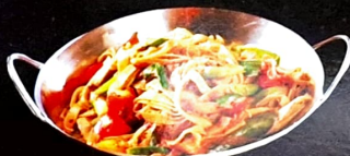
102. Dry Wok Beef Tripe in Special Chilli Sauce 干锅牛百叶 £14.80