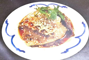
6. Ox Offal Slices Mixed beef offal with peanut and celery bits in spicy sauce. 夫妻肺片 £8.80