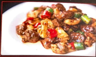
60. Stir Fried Beef & Mushroom with Black Pepper 黑椒牛柳粒 £14.80

Boiled with bean sprout in a spicy lip-tingling sauce 水煮牛肉 £16.80