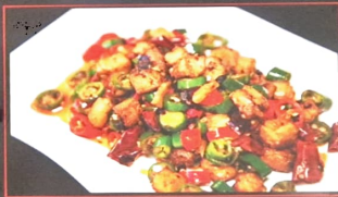
68. Duck in Sichuan Chilli

Stir fried chicken with black beans garlic and chilli 豆豉鸡丁 £12.80