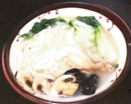
Mixed Mushroom and Green Vegetable Noodle in Soup 鲜菌汤面 £10.50