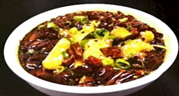
32. Traditional Boiled Fish Slices in Chilli Oil Marinate fish slices boiled in special chilli oil with beansprout and Chinese cabbage 水煮鱼 £22.80