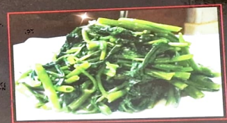
81. Stir Fried Water Spinach with Garlic Sauce 蒜蓉空心菜 £9.80