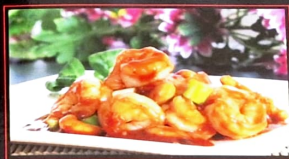
38. Gong Bao King Prawns Quick fried with cashewnuts, celery & chilli, a little bit sweet sour spicy 宫保虾球 £15.90