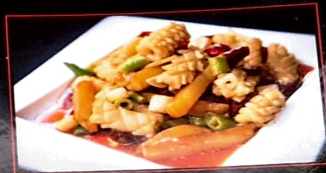
40. Gong Bao Squid Quick fried with peanut & dry chilli in sweet sour spicy sauce 宫保鱿鱼 £15.90