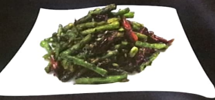
74. Dry Fried Green Beans with/without Pork Mince 干煸四季豆 £9.80