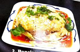
2. Boneless Chicken in Chef Special Sauce Served on bamboo shoots with sesame, peanut sauce and chilli oil. 麻酱鸡 £8.80