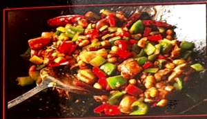
64. Gong Bao Chicken with Peanuts

Stir fried with garlic ginger spring onions and dry chilli in sweet sour spicy sauce 宫保鸡丁 £12.80