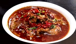
58. Water Boiled Tender Beef

Boiled with bean sprout in a spicy lip-tingling sauce 水煮牛肉 £16.80