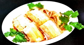
1. Pork Belly Slices Boiled pork belly with cucumber, chilli oil in special garlic sauce. 蒜泥白肉 £8.80