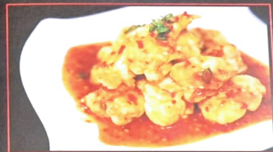
39. Fish Fragrant King Prawns Prawn in batter, deep fried in sweet sour and spicy sauce 鱼香虾 £15.90