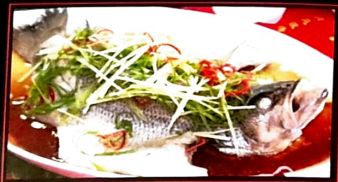
30. Steamed Sea Bass Steamed with ginger and spring onions 清蒸鲈鱼 £22.80