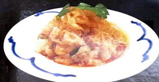
7. Jelly Fish with Cucumber in chilli oil. 红油蜆丝 £8.80