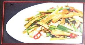
75. Dry Tofu with Garlic Chives Stir fried with Chinese leek and fresh chilli 韭菜香干 £10.80