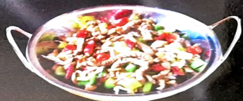
103. Dry Wok Cooked Pork Belly Slices 干锅回锅肉 £13.50