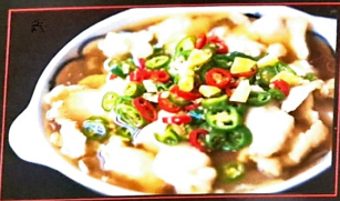
34. Fish Slices with Oyster Mushrooms Marinated fish slices with bean curd skin, oyster mushroom and fresh chilli 鲜菌汇鱼片 £20.80