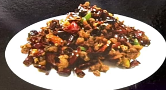
65. Traditional Fragrant Chicken (bony)

Quick fried with dry chilli, Sichuan chilli peppers and sesame seeds 辣子鸡 £14.80