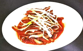
5. Crystal Pig's Ear with spring onion and chilli oil. 红油耳尖 £8.80