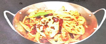
107. Dry Wok Lotus Root Slices in Special Chilli Sauce 干锅藕片 £12.90