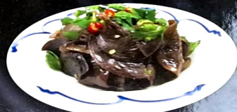
8. Cloud Ear Fungus with Coriander Slippery black wood mushrooms with chilli, hot and sour sauce. 香菜木耳 £7.90