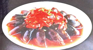
10. Preserved Duck Egg with fresh chilli, chilli oil and soya sauce. 烧椒皮蛋 £8.50