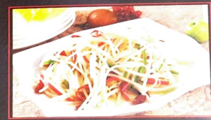
82. Stir Fried Potato Slivers with Vinegar Chilli 酸辣土豆丝 £9.50