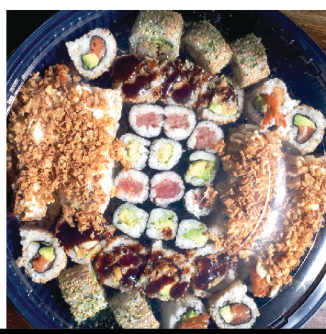
PLATTER SET 2 Sushi & sashimi selection FULL