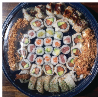
PLATTER SET 1 Sushi & sashimi selection FULL